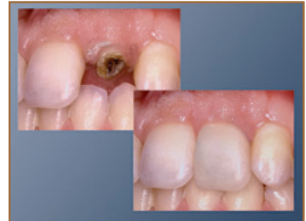
Crown fully restores tooth