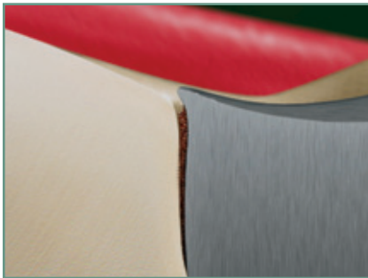
Bacteria between the tooth and filling

Replacing a failing amalgam filling with a new restoration can prevent more decay from developing and keep your mouth healthy.