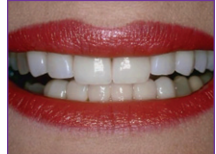
A natural-looking choice